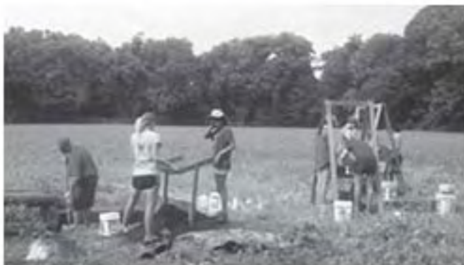
NIAHD students excavate at Fairfield in the midden area

After recovering from this flurry of activity, we soon had to