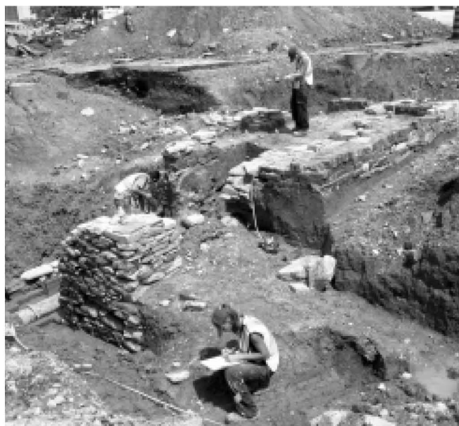
Figure 1. Looking southeast during excavation of the stone privy vault and the brick structure that replaced it.

The privy foundation was 26 feet long by 10 feet wide and constructed from limestone blocks bonded with mortar to form 20-inch-thick walls (Figure 1). The interior privy vault was sectioned, and it proved to be approximately 8 feet deep (2.6 m); the floor of the vault was lined with mortared red bricks laid as stretchers perpendicular to the long axis of the building. Only the upper 20 cm of the privy shaft fill comprised organic soil containing artifacts. The balance comprised architectural rubble believed to originate from the demolition of the building, including limestone fragments, mortar, red brick fragments, and a limited amount of silty loam soil. Very few artifacts were found in the rubble. It was apparent that after the privy superstructure was demolished and the vault backfilled, leveling fill was brought in and a new structure was erected upon a brick foundation offset from the old privy shaft. This