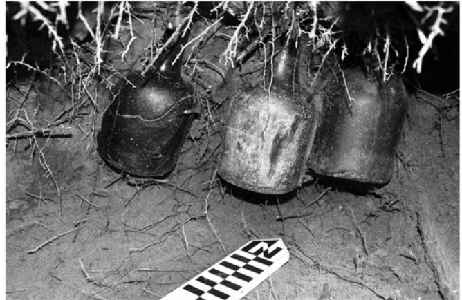
Figure 2. Some of the complete wine bottles found underneath the tree stump.

portantly, underneath the largest tree that was removed—now an enormous stump—the team discovered finds that had been “protected” over the years by the extensive root system. Underneath the stump there were bayonets, Spanish coins, six complete wine bottles (Figure 2), scales for weighing merchandise, a brass spigot, and even a large “hoard” of Spanish milled dollars that had been deliberately buried in the cellar floor (Figure 3).