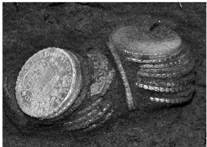
Figure 3. Twenty Spanish coins (19 milled dollars and one 8-real cob) discovered in the cellar floor; no traces were left of the purse or bag that they were buried in.