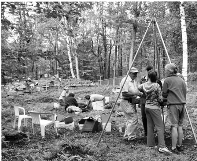
Volunteers working at the New England Glassworks in Temple. The foundation of the glasshouse appears on the left.