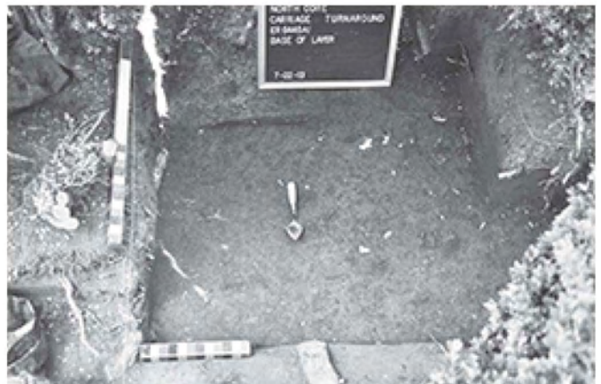
Figure 3. The linear feature containing the fragment of ceramic with the Napier transfer print (c.1833-1846).