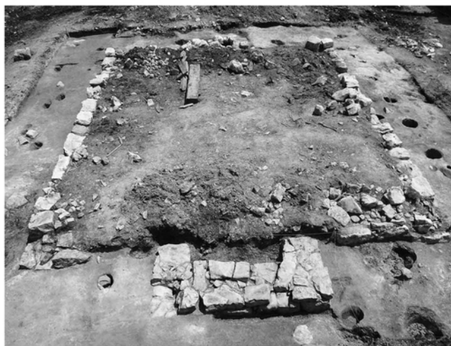
McCoy's Fort limestone foundation, chimney bases, and series of post holes.