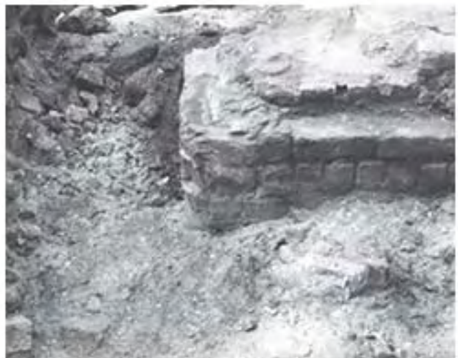
Unexpected cellar opening and interesting row of rowlock bricks uncovered during excavations