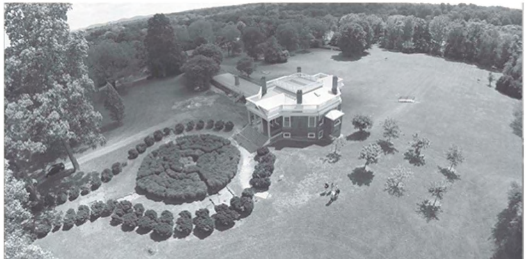
Figure 1. View of the Carriage Turnaround and boxwoods prior to removal. This is one of numerous aerial photographs of the boxwoods taken with a remote controlled helicopter.