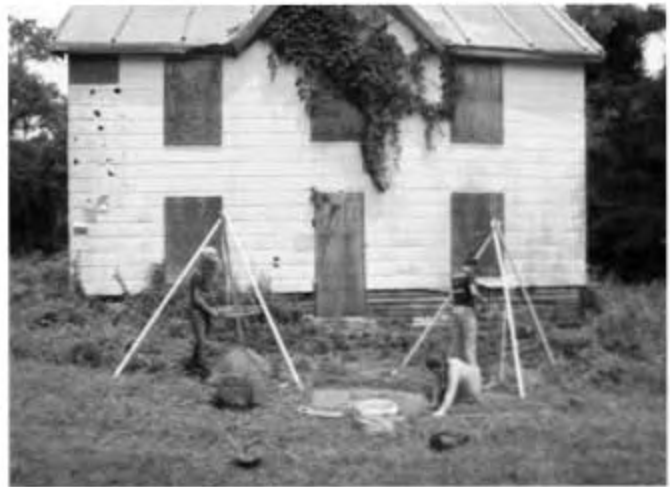
Test Excavations at the Wilson House, Galesville, Maryland.

Seven test units were excavated around the house with very interesting results. Thousands of artifacts were recovered, including beautifully decorated whiteware and ironstone tablewares, porcelain doll parts, dozens of buttons and a pair