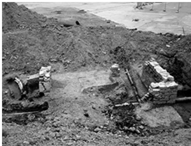
Figure 2. Looking southwest during excavation of the cleaning shed foundation.

The cleaning shed was probably constructed as a place where the soldiers could wash and shave; sometimes these buildings are labeled as "ablutions room" on old maps. Sections of the foundation were no longer extant but it was complete enough to estimate that it was 22 feet long by 11 feet wide and constructed from limestone blocks bonded with mortar to form 22-inch-thick walls (Figure 2). The north, south, and east walls appeared to be continuous but the west wall comprised square piers. An arch was constructed beneath the north foundation