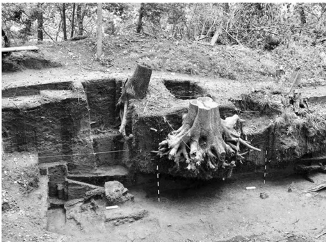
Figure 1. The west cellar wall of the sutling house in Fort Edward.

Even though 2010 was originally meant to be the final year of digging at the sutling house, our team returned to the site in 2013 because of extensive erosion and annual flooding; these natural forces had essentially guaranteed that little would be left for the future if we did not take action immediately. Just before the excavation began this past summer, a professional logger removed the last trees that were still standing along the west side of the cellar, and we then exposed the burned west wall of the cellar, much more intact than the walls had been on any other side of the building (Figure 1). Just as im-