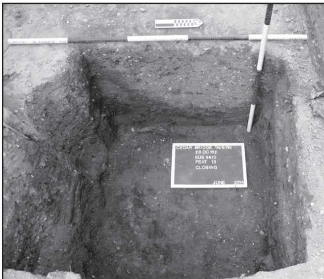
The box privy located at the Cedar Bridge Tavern.