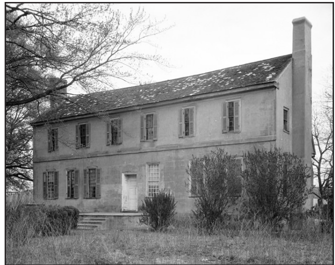
The Dwelling at Melwood Park, Photographed in 1936 for the Historic American Building Record

The endeavor to stabilize and restore the historic dwelling at Melwood Park is an exemplary collaboration between private owners and stewards of the property, historic preservation