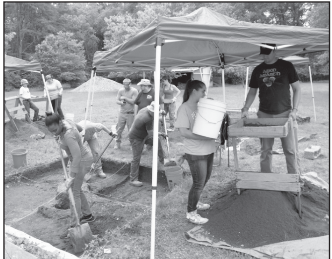
The Monmouth University field crew at work on the block excavation.