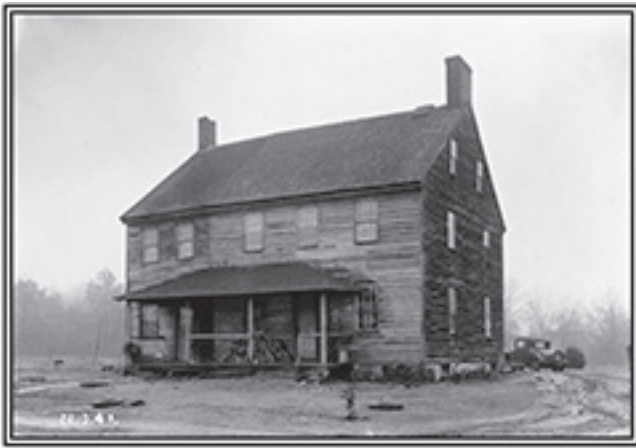
Cedar Bridge Tavern as it appeared c. 1938 when documented by Historic American Building Survey photographers. Note that the portion of the tavern on the right is the original late 18th-century structure, and the 1830s' addition is visible on the left.