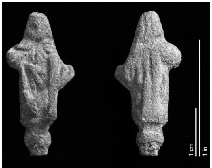
Copper alloy "Apostle Spoon" depicting St. Andrew

This summer's excavations recovered a number of remarkable artifacts ranging from the finial of an "Apostle Spoon," through an elaborately decorated turned bone needle case, and an unusually complete molded Dutch pipe.