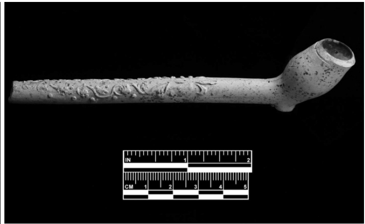
Calvert House: Elaborately molded Dutch Pipe.