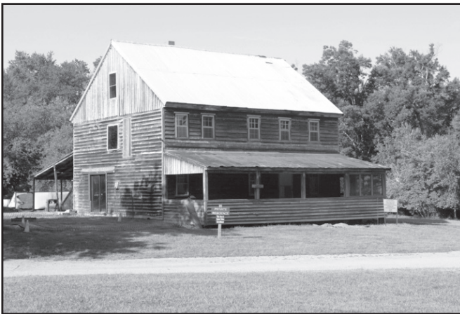
Cedar Bridge Tavern as it appears today, poised for a major restoration project.