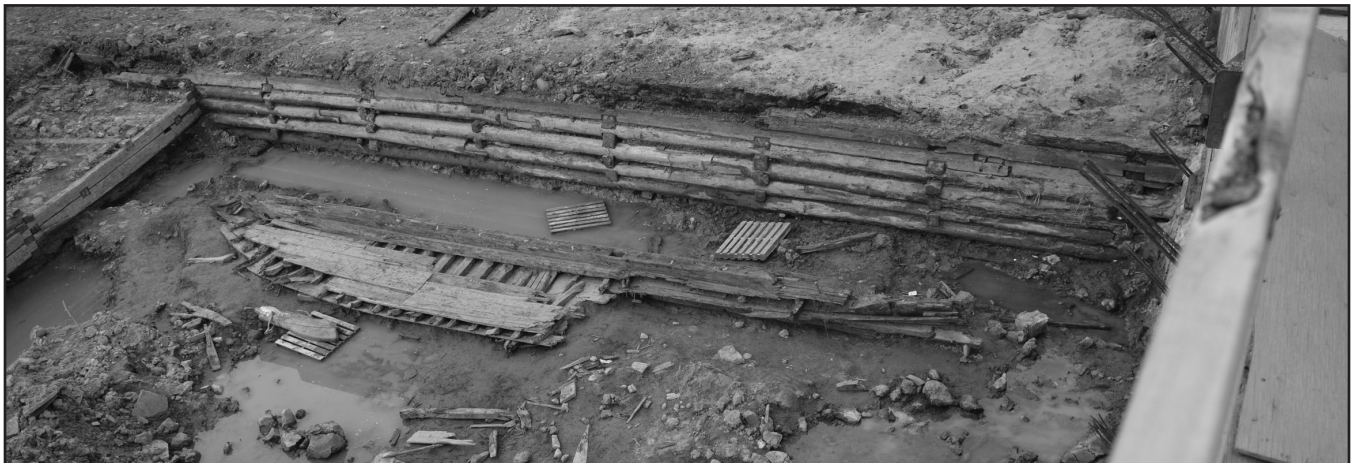
Figure 1: Exposure of the schooner remains adjacent to the 1830s Queen's Wharf

Beginning in March of 2015, Archaeological Services Inc. (ASI) returned to the mid-nineteenth-century site of the Grand Trunk Railway's Queen's Wharf Station, located on the former front of Toronto's harbor to carry out. Previous investigations on the site, carried out in 2011 (see 2012 Winter News) had revealed a portion of the Grand Trunk's engine house, cribbing related to the channelization of Garrison Creek through the station yard, the landward portion of the Queen's Wharf and various elements related to landmaking operations. The 2015 excavations were located on a block of land to the immediate south of the 2011 excavation area, and straddled the 1850s-1870s shore walls established by the Grand Trunk. The main objectives of the 2015 work were to record the remains of the shore walls, structures related to the engineering of the creek, and the offshore portion of Queen's Wharf. This section of the Queen's Wharf was originally constructed in the early 1830s and defined the harbour entrance. Its width was then almost doubled in the 1850s.