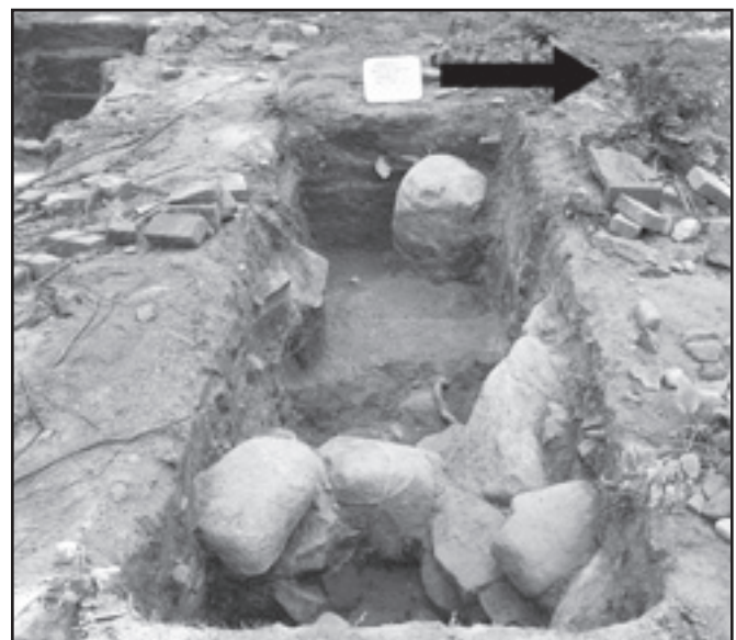
Figure 2. Units Y37, Y38, and Y39, showing foundation stones of the summer kitchen.