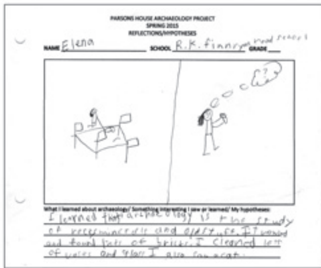
Figure 1. The archaeological process as drawn by Elena, a third-grade student at R.K. Finn Ryan Road Elementary School. She writes, "I learned that archaeology is the study of rocks, minerals and old stuff. I troweled and found lots of bricks. I cleaned lots of vases and glass. I also saw a cat."

Artifact analysis is ongoing but preliminarily it appears as though the majority of the artifacts excavated relate to the mid-19th century occupation of the house. Surprisingly,