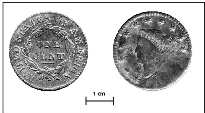
Figure 3: The U.S. Coronet Head penny recovered from the aft mast step

The identity of the ship is not yet known. Nor is it clear exactly how she arrived at her resting place beside the wharf, or why much of her structure was deliberately demolished. These questions, along with others related to her design and construction will be subjects of on-going research. Current evidence, in the form of a coin deliberately placed in the aft mast step, suggests that she was built in the late 1820s. The