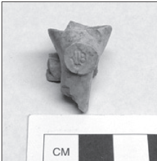
Figure 2. The marked RB pipe bowl.