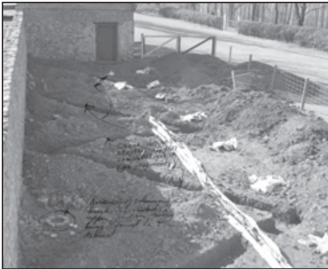
Figure 1: Cross-trenches at the North Dependency in 1938.

stable located on the far eastern end of Mulberry Row, a long walk from the main house. The North Dependency was a much more convenient spot.