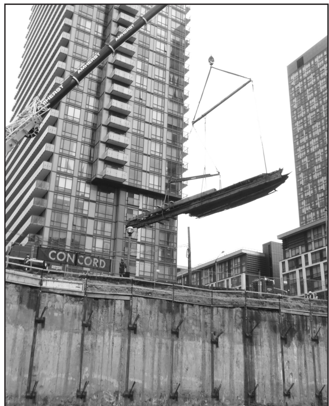
Figure 4: Lifting the ship remains for transfer to Fort York National Historic Site.

It would seem that the useful service of the vessel had ended by the late 1870s when the shallow waters in which she lay were cut off from the lake by a crib wall shore wall and the area was filled in over the course of the next few decades. It is possible that she ended her life as a barge, for bulk cargo