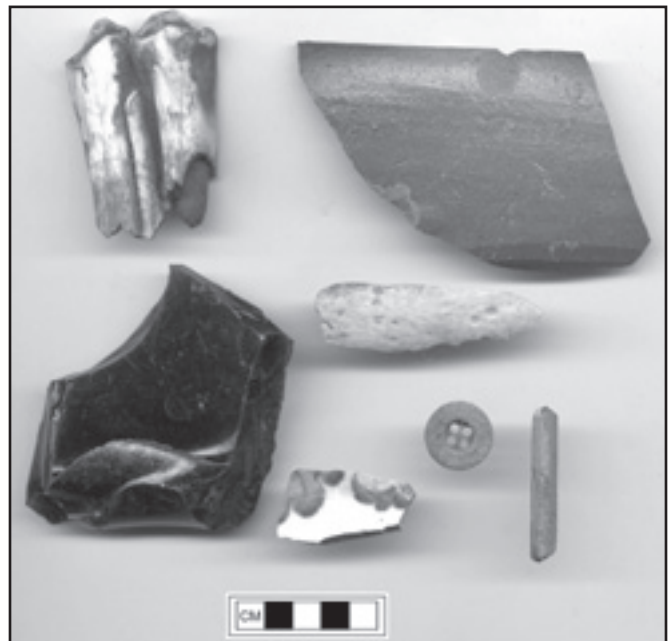
Figure 3: Artifacts found at the North Dependency-Stable excavations. (L-R): Cow's tooth, British stoneware vessel fragment, dark green bottle base fragment, bone utensil handle fragment; transfer printed pearlware, copper button, slate pencil.

for the long-vanished frame north wall of the dependency. Forty years later, Monticello's Archaeology Department, under the leadership of Dr. William Kelso, sought to find evidence for a formal carriage turnaround in the yard north of the dependency. A conjectural plan drawn by Jefferson in the 1770s shows this feature ( http://www.masshist.org/thomasjeffersonpapers/doc?id=arch_N61&mode=lgImg ). However, the lack of any archaeological evidence for it indicates it was never built.