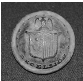
Figure 2. Civil War New York regimental button.