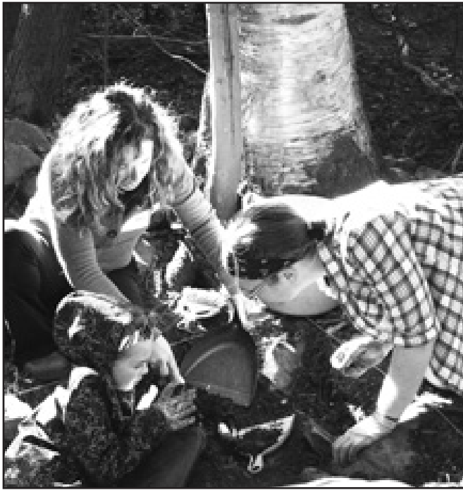
Figure 1. Participants learn to excavate in units spanning the width of the bunkhouse foundation.