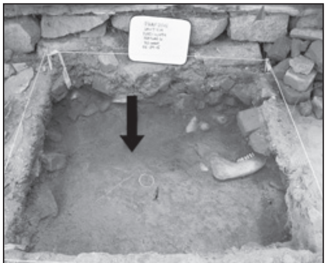
Figure 3. Unit Y19, showing cow mandible, bottle base, and brick.