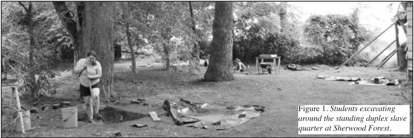
Figure 1. Students excavating around the standing duplex slave quarter at Sherwood Forest.