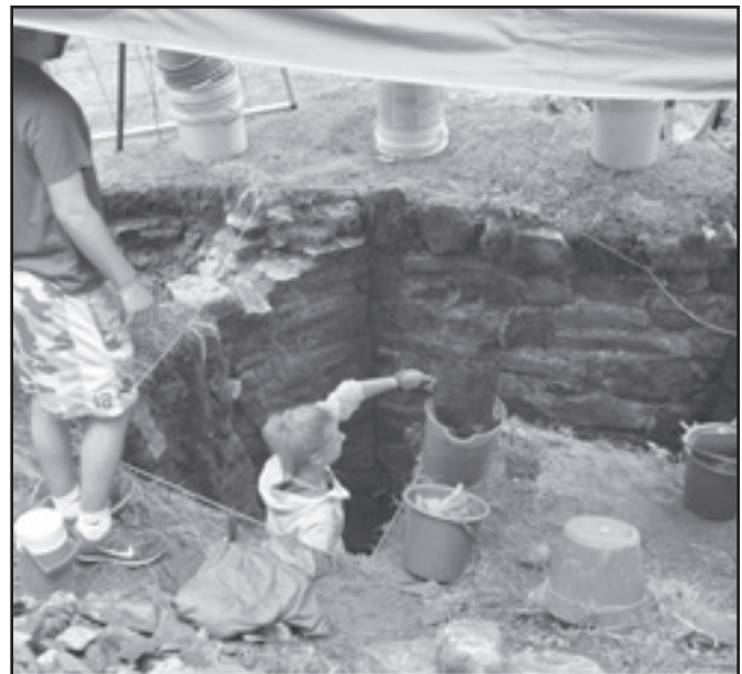
Excavating walls inside the bastion of Fort George.