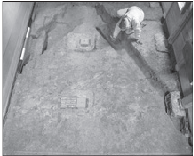
Figure 2: Archaeologist with excavated quadrants in the North Dependency.

There have been two previous excavation campaigns. Prior to the North Dependency reconstruction, Grigg dug cross trenches across the area in a zig-zag pattern (Figures 2 and 3). Like his contemporary digging architects at Colonial Williamsburg, he used cross trenches in hopes of maximizing his chances of finding brick walls (for more on cross trenching at Monticello, see: http://www.monticello.org/site/blog-and-community/posts/archaeology-mulberry-row-%E2%80%93-little-history-part-1 ). While a photograph shows the bags of artifacts Grigg's workmen found, those artifacts are now missing. Grigg located what he thought was the original sill