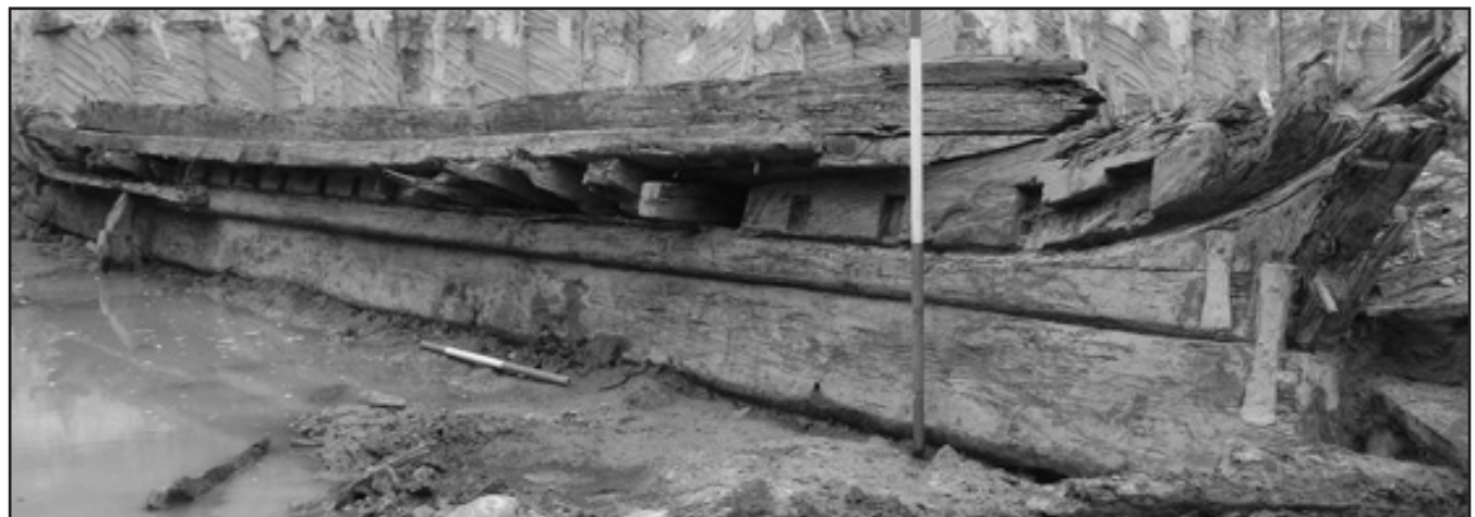
Figure 2: View of the starboard side of the schooner at the bow.