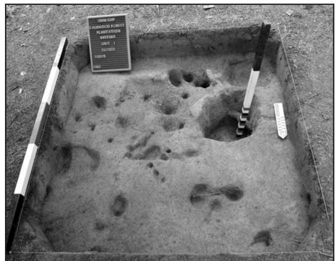
Figure 3. Yard features near the kitchen/laundry quarter.

Our secondary goal on this project was to document changes in the landscape around the historic plantation core. Above ground features, such as rows of trees, fence lines, and boxwood hedges, indicate fairly substantial changes in the cultural environment sometime after the Fitzhugh ownership, perhaps related to the placement of a late-19th-century family cemetery several hundred feet north of the standing wooden slave quarter. One of the more surprising archaeo-