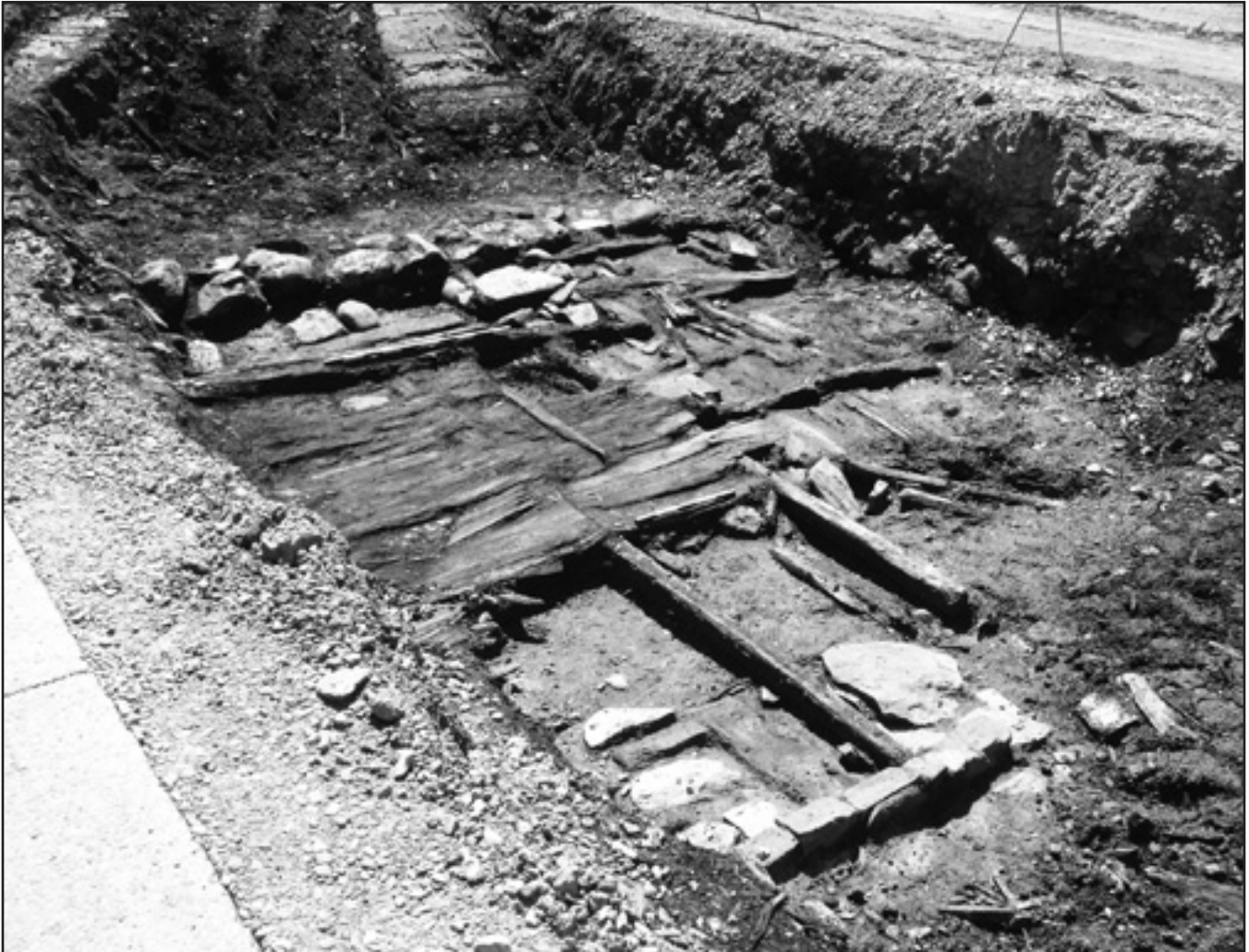
Figure 2. One of the features along Lower Water Street with its wooden floor partially removed to show floor joists over bedrock, and a stone wall along the south side against sterile soil.

To readers with archaeological experience it will be clear that this site is still in the earliest stages of interpretation, with some fieldwork still to come before artifact washing, mending, cataloguing, mapping, follow-up research, and reporting help us to refine our understanding of this broad slice of Halifax's history. In the meantime, we hope you have enjoyed this glimpse into our current research.