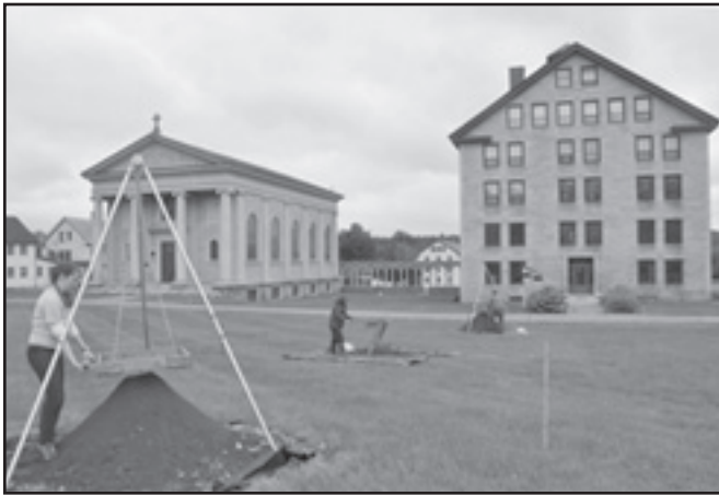
Excavating in front of the Great Stone Dwelling at Enfield Shaker Village.

Field work in 2015 exposed the extensive remains of this building's foundations, together with an interior brick wall and Shaker artifacts lying on the cellar floor. It is anticipated that a broader range of sites will be examined in 2016, including the Shakers' mill system.