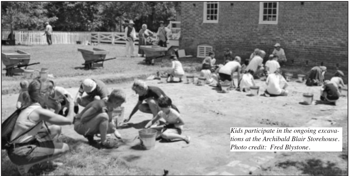
Kids participate in the ongoing excavations at the Archibald Blair Storehouse.

graphing the cellar, both the fill and artifacts were tossed back.